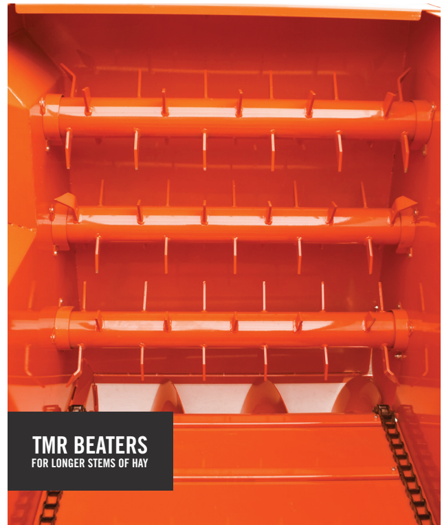
TMR BEATERS FOR LONGER STEMS OF HAY