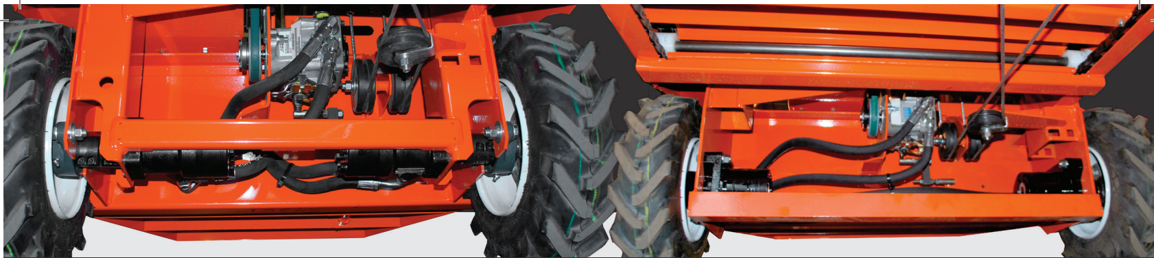
E.30 and E.42